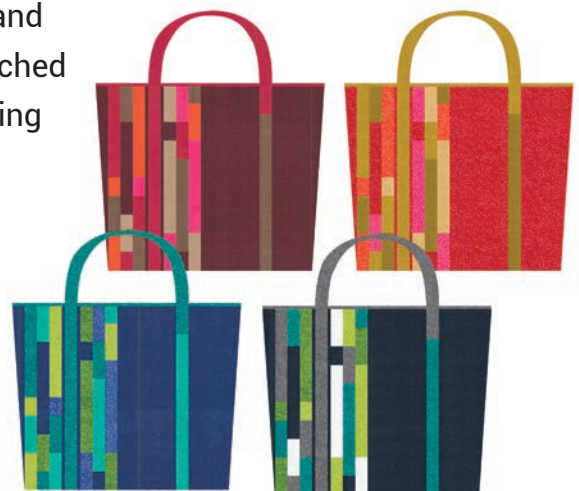
RPQP CT167 Colorblock Tote 18" x 15"

Play with color using yardage or a pack of precuts, including a Dessert Roll of 5" wide WOF strips of the 20 colors. Two new patterns support the Dessert Roll format. "Crosswalk Plus" is a 60" square quilt that has two background colors and could also use the substitution of a Layer Cake. "The Arrow Maker" uses a Dessert Roll or 9 Fat Quarters for the 59" x 57" modern arrow design. The "Colorblock Tote" shows a couple options to mix color strips and combine regular Thatched and Dotty Thatched into a striking tote bag.