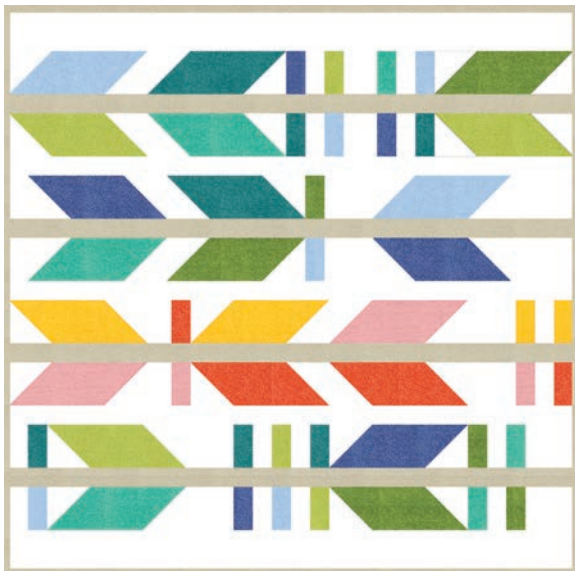
RPQP AM166 The Arrow Maker 59" x 59" DR Friendly

It's time for little dots to come play on my Thatched fabrics! "Dotty Thatched" has little dots with a random and loose feel, honoring the things we make by hand. Variation and imperfection have a beauty and freedom to them. This Dotty Thatched release brings 20 colors including popular basics like Navy, Royal, Scarlet, Tangerine, Blizzard, Shadow, Gray, Fuchsia and Washed Linen. Enjoy a charming new Sunshine Yellow that brings happy feelings with Princess Pink and Grass Green.