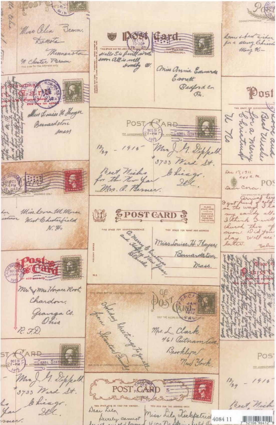
Sentiments has been reduced approximately 50% to show overall pattern